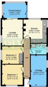
Total floor area 75.6 m² (814 sq.ft.) approx. This floor plan is for illustrative purposes only. It is not drawn to scale. All measurements, floor areas (including any total floor area), openings and orientation are approximate. No details are guaranteed. They cannot be relied upon for any purpose and they do not form part of any agreement. No liability is taken for any error, omission or misstatement. A party must rely upon its own inspection. Powered by www.houseagent.com